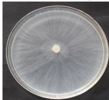
G. Reisolated culture