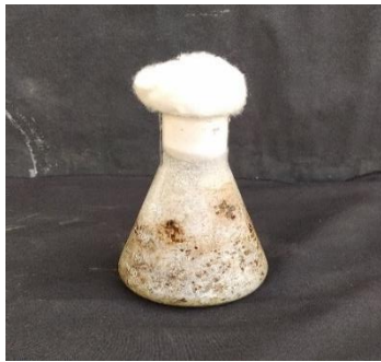
A) Wheat grain substrate used for multiply R. solani