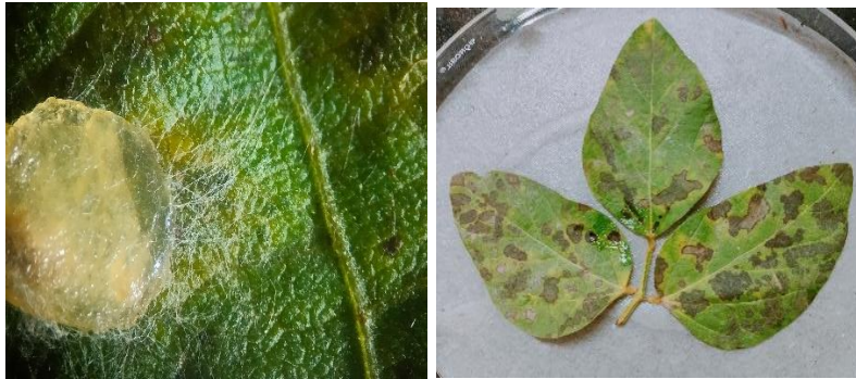
Plate 1: Pathogenicity test of different isolates of Rhizoctonia solani by detached leaf assays