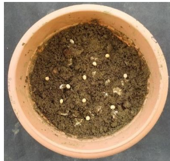
E) Seeds sown in sick pot