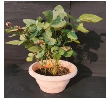
F) Symptom development