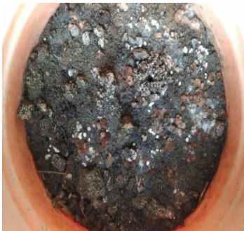
D) Sclerotial formation