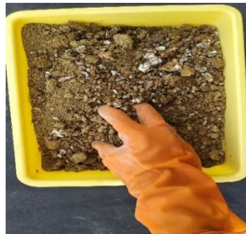
B) Mixing in soil