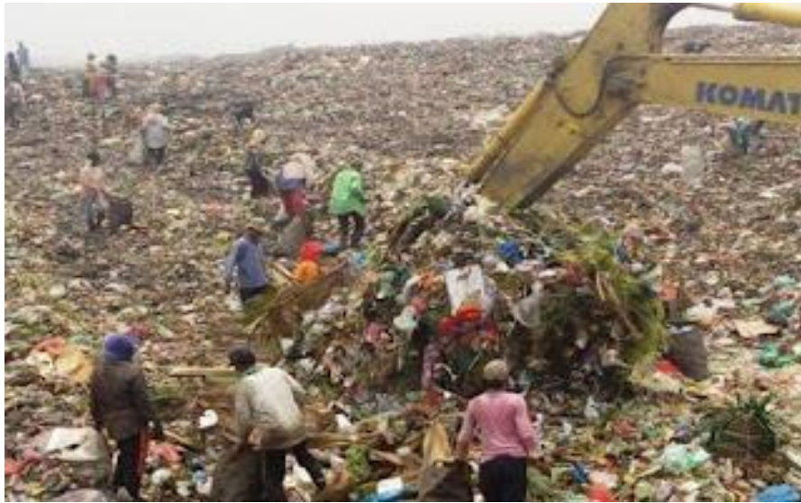
Image 1. Terjun Final Disposal Site

and later stabilizing at 16 tons per month with 12 workers. The production of BBJP significantly contributes to waste reduction, with daily waste reduction surpassing 1 ton per day.