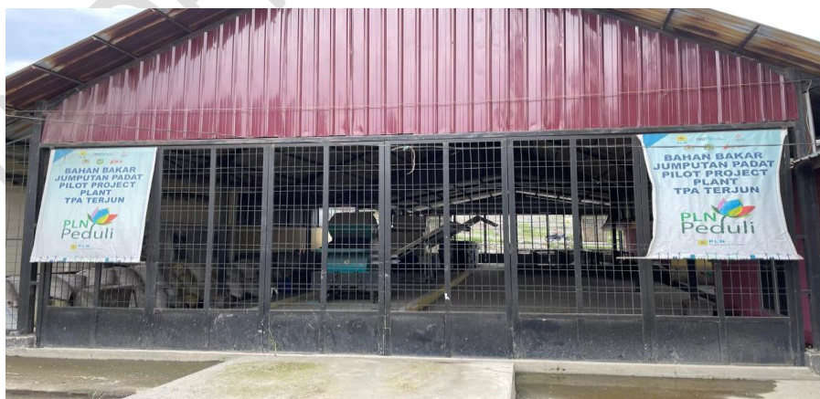
Image 2. BBJP Production Equipment at Terjun FDS

Although the production of BBJP at the Terjun FDS is still far from the co-firing target of 120 tons per day, RDF implementation has made a tangible impact on waste management. The Medan City Government has assumed full control of the BBJP production equipment, which was previously managed by PLTU Pangkalan Susu. As the Terjun FDS nears its capacity limit, the city government has been compelled to find more effective waste management solutions. RDF is considered a strategic and viable alternative in this context.