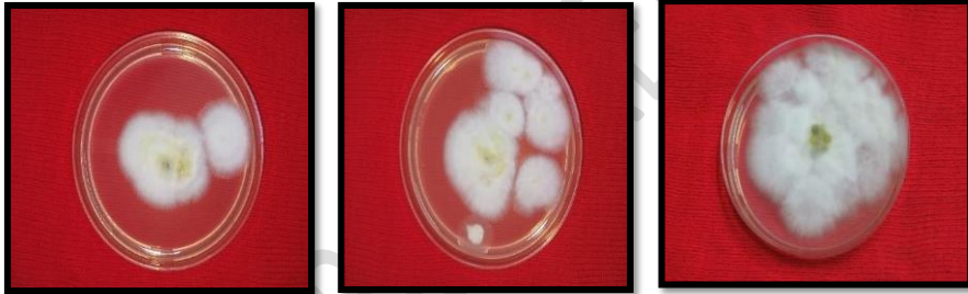
Novaluron 5.25%+ Emamectin benzoate 0.9% SC