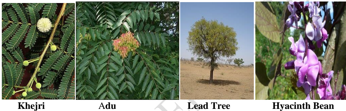
Fig. 2 :- Tree and Grasses

average family size in the area was 9.67. It was higher in case of large farmers followed by marginal, small and medium farmers (Table 3). The (number of persons engaged and dependent on agriculture was higher in case of large farmers followed by medium, small and marginal farmers. However, due to limited resources such as land and agricultural inputs, marginal and small farmers were found to supplement their livelihoods by taking on other jobs including working as hired agricultural labourers. Crop production and animal husbandry served as the primary livelihood for 89.5% of the population in the semi-arid region of Rajasthan. The overall human-to-land ratio in the region was 1.37, with the highest ratio observed among marginal farmers, followed by small, medium, and large farmers (Chaturvedi et al., 2002). Similarly, Saran et al. (2000) reported that the human-to-land ratio in the Bundelkhand region of Uttar Pradesh, another semi-arid area, closely mirrored that of Rajasthan.