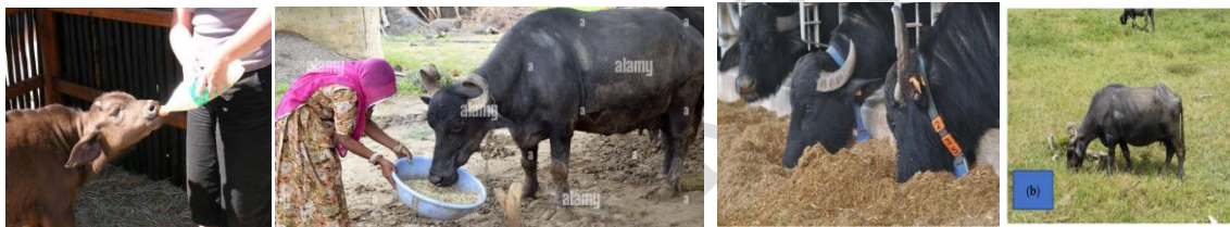
Fig. 3 :- Different feeding methods for buffaloes

semi-arid regions of the country. It is a combination of limited free-range grazing on available pasturelands and feeding in the stalls with feed and fodder supplements. Integration of buffalo rearing with arable cropping and tree cropping is also included and cut and carry system of available fodders is employed. The buffaloes are grazed for 4-6 hours and supplemented with varying amounts of natural and cultivated green and dry grasses, fodders, crop residues, straws, grains, oil seeds, oil cakes and agro-industrial by-products etc. The buffaloes utilize all available feed resources under this system. The level of nutrition is just optimum or little low but surely far better than that of extensive system. Production performance of the buffaloes depends on the quantity and quality of the grazing pastures and supplementary feeding. The dry grasses, fodders, crop residues and straws are mostly fed to cattle and buffaloes as whole without chaffing in most of the arid region. It was interesting to note that there were in general no chaff cutters, mangers and tying chains available in the area for even large ruminants for providing supplementary feeding. Under such circumstances, there was a great scope for improving the productivity of buffaloes through increasing feeding values of the poor-quality roughages available in the arid and semi-arid areas by adopting simpler, cheaper and feasible feed and fodder processing, enrichment and conservation technologies.