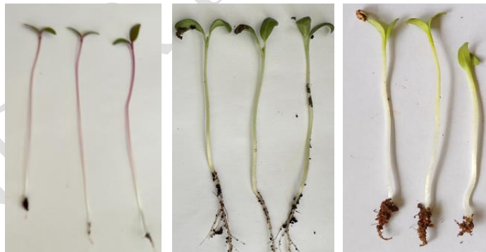
Plate 2: microgreens of Red amaranthus, Fenugreek and Spinach

This result was supported by the study conducted by Gunjal et al. (2024) where the beetroot microgreens showed a leaf length ( 0.77\pm 0.15 cm), a leaf width ( 0.16\pm 0.08 cm), and a total leaf area ( 0.10\pm 0.06 cm 2 ), while red amaranthus microgreens had a shorter leaf length ( 0.44\pm 0.05 cm), a similar leaf width ( 0.15\pm 0.02 cm), and a smaller total leaf area ( 0.05\pm 0.01 cm 2 ) were observed.