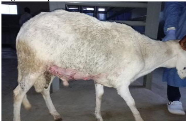
Fig. 2. A- The animal after surgical repair