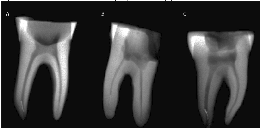
Figure 2. Radiographic images (A-C) of fractured instruments in the root canal after exploration with Wave One Gold Glider (A-B) and R-Pilot (C).