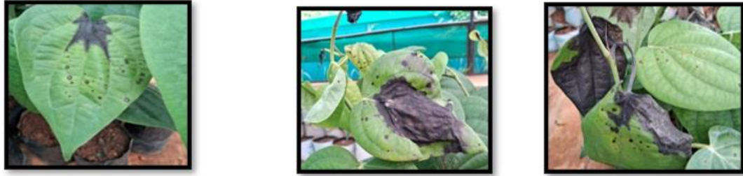
Fig.2. Symptoms of foot rot in black pepper