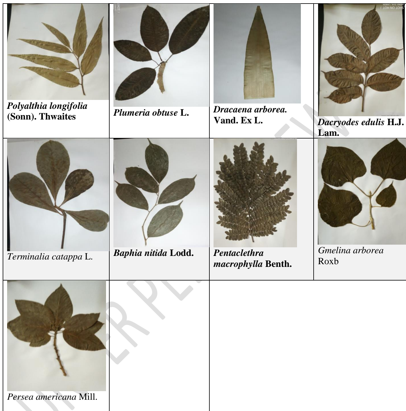
Figure 1: Photographs of some plant press leaf samples.