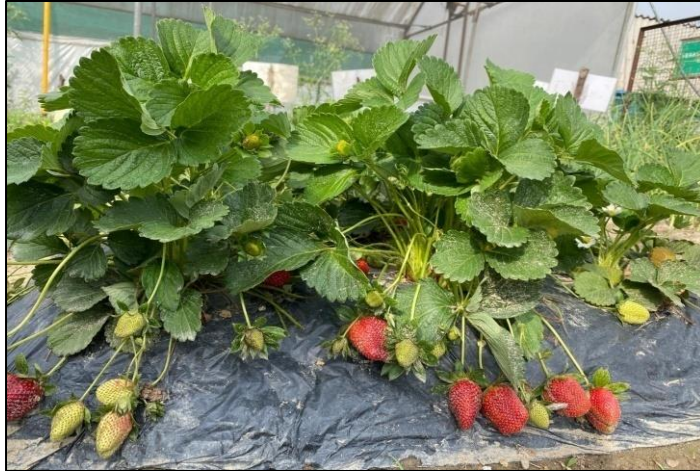
Plate 1. Fruiting stage of strawberry at experimental site