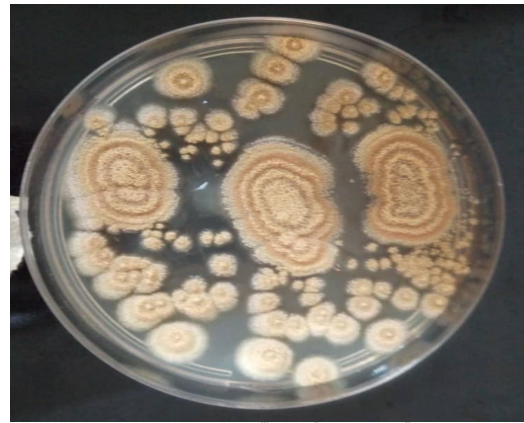
PLATE 1: FUNGAL ISOLATES ON PDA PLATES.