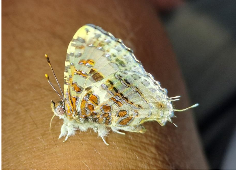
Image –3: Catapaecilma major Druce, 1895 - Common Tinsel