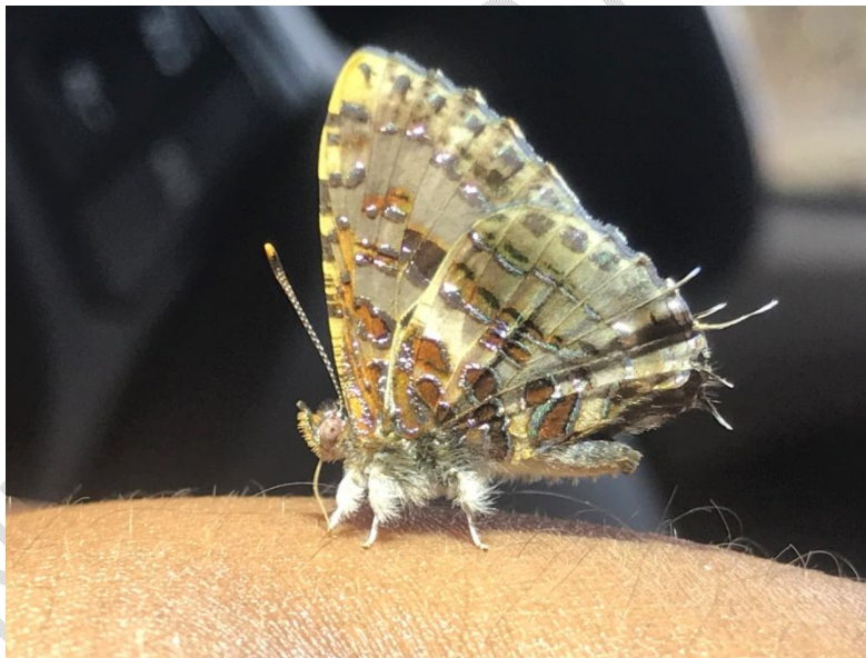
Figure-2: Catapaecilma major Druce, 1895 - Common Tinsel © H. N. Tandan