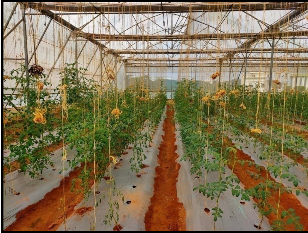
Plate 1. Field view of screening of tomato germplasm lines against fusarium wilt and tomato leaf curl virus diseases in naturally ventilated poly house conditions.