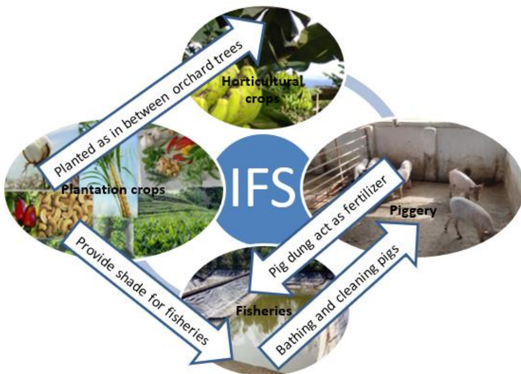
Fig. 2 Model of Horticulture, Piggery, Fisheries and Plantation crops