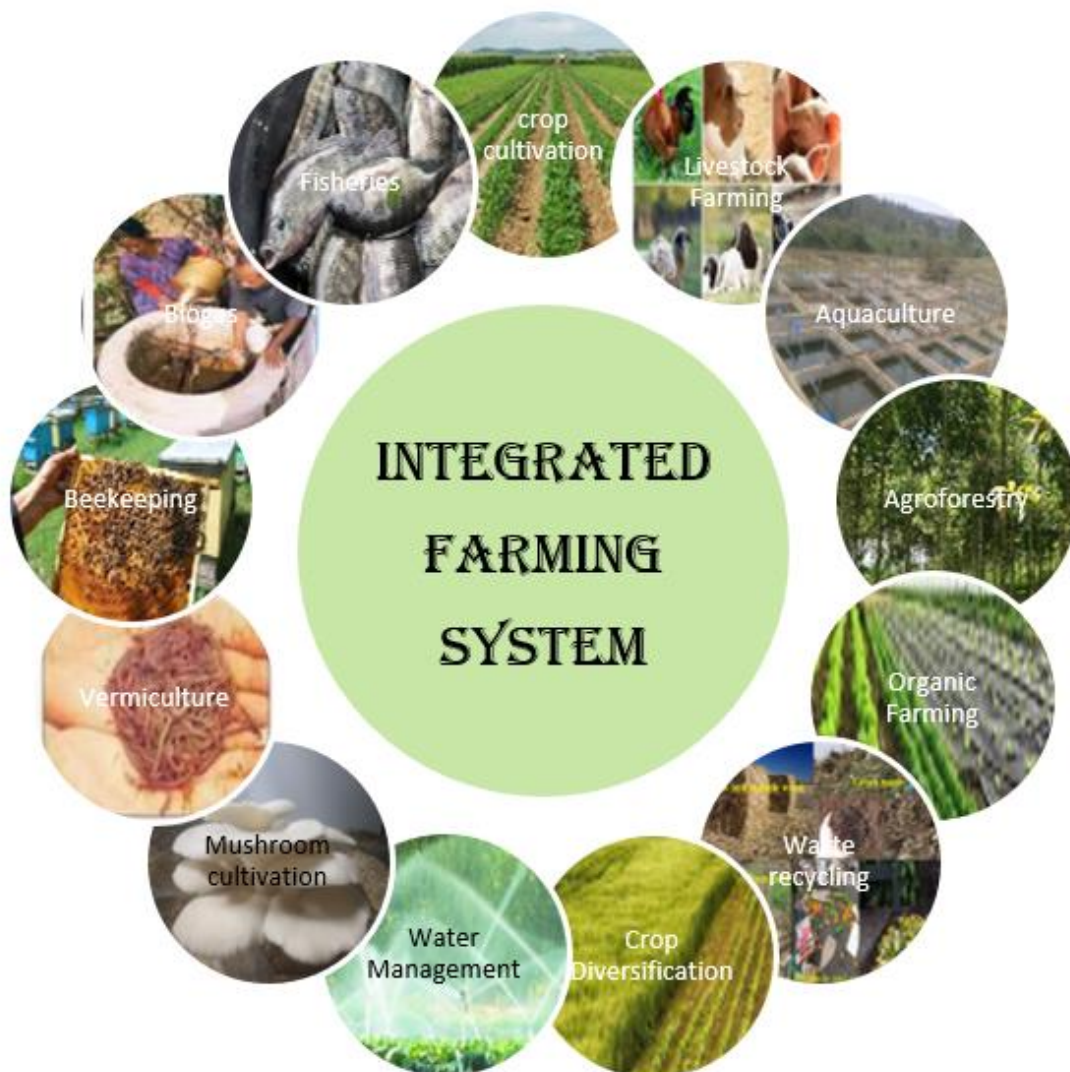
Fig. 1 Components of Integrated Farming System

Overall, the different components of IFS are integrated in a way that maximizes the efficient use of resources and minimizes negative environmental impacts. The integration of different components provides a range of benefits such as diversification of income sources, improved soil fertility, and increased food security. The IFS systems involving different landbased enterprises generated net returns of USD 5050 than conventional rice–wheat system.