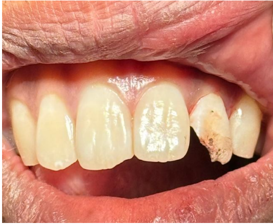
Fig-15 Reimplantation of 22 into the socket