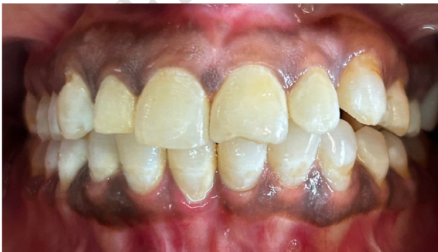
Fig-12 Intraoral picture after splint removal.