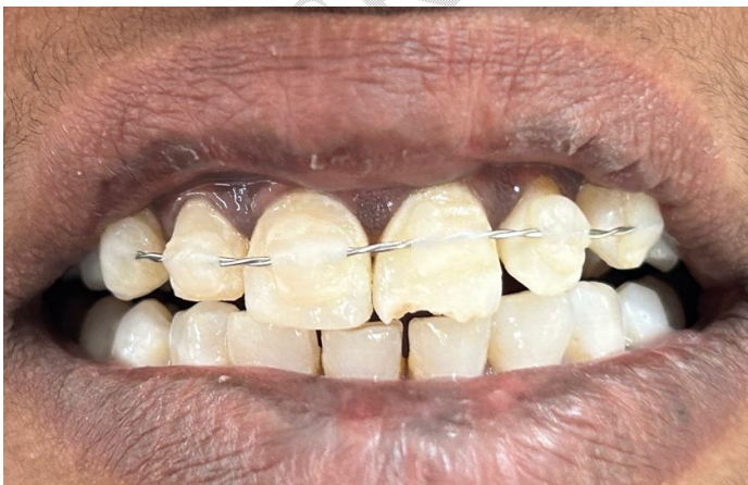
Fig – 9- One month post operative intraoral picture showing healing of lacerations