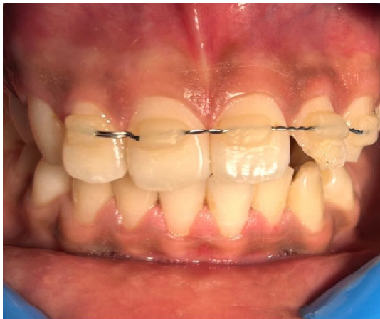
Fig -17 Splinting from 12 to 23