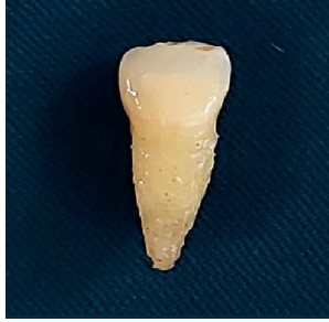
Fig3 – Avulsed tooth -22