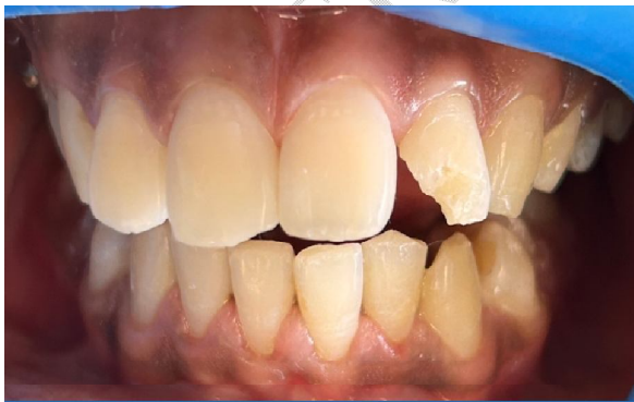
Fig - 19 Splint removal done after 6 weeks