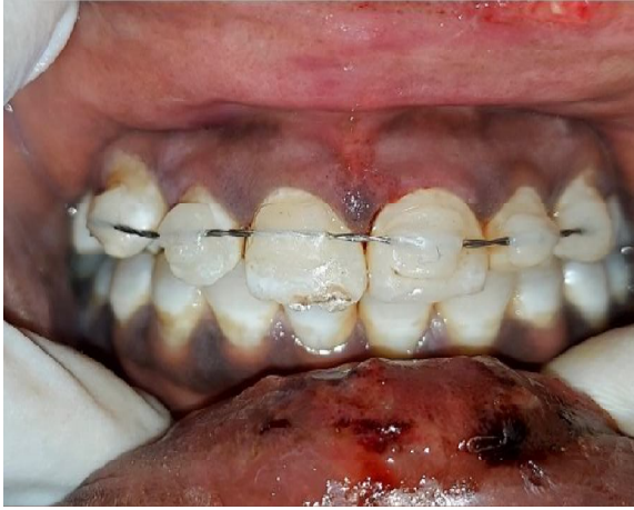
Fig-7 Intraoral picture of splinting from canine to canine