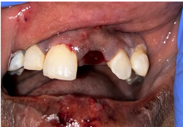
Fig 1- Preoperative picture of empty bleeding socket -21

6 month followup showed no mobility and on radiographic examination no sign of resorption, no periapical changes noted. (Fig-11,12)