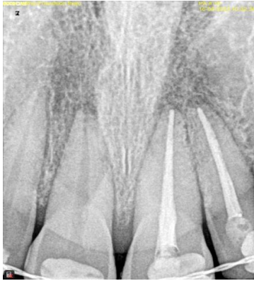
Fig-10 - One month followup radiograph