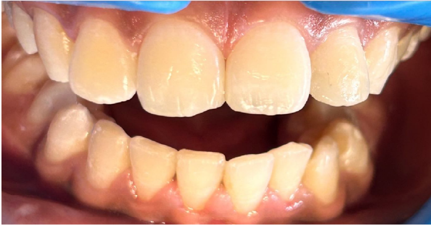
Fig-21 Composite restoration done -22