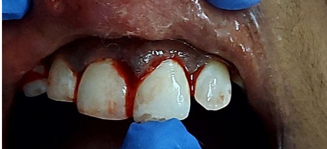
Fig 4 – Repositioning of the Avulsed tooth into the socket