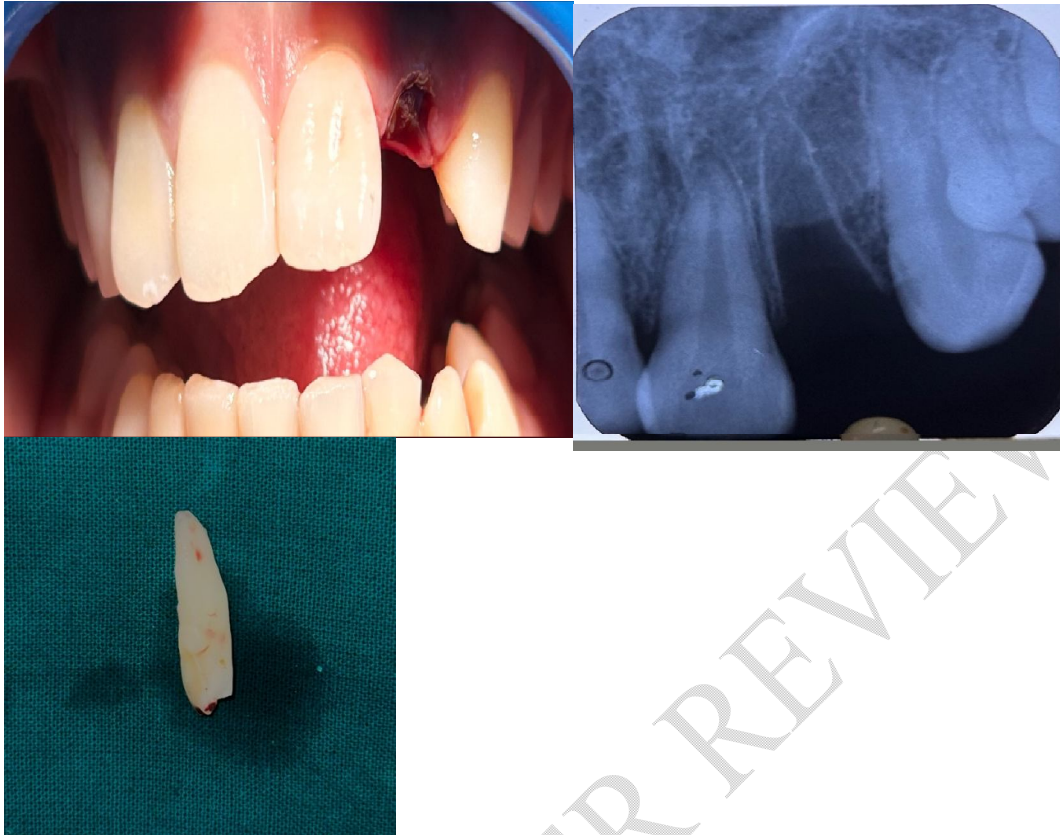
Fig 13.a preoperative picture showing empty space near 22 region 13.b shows empty socket without any fractured root fragment, 13.c Avulsed tooth