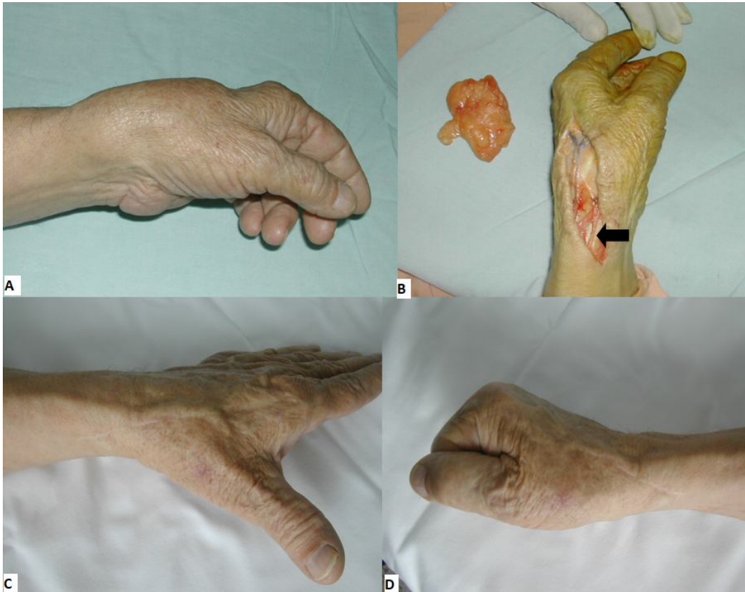
Fig. 2. A: Clinical presentation of a lipoma of the anatomical snuffbox. B: Intraoperative findings: Lipoma Displacing the SBRN (Arrow). C+D: 1 year post operative.