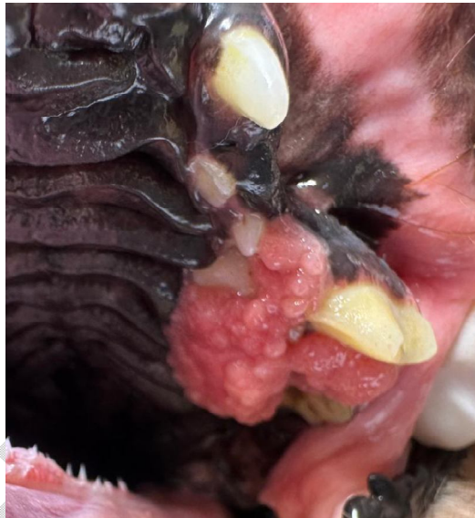
Figure 1. Gross aspect of the mass in the left maxilla. Firm, friable mass, similar to gingival tissue, pink to red in color, multilobulated in appearance, with irregular contours, non-ulcerative, measuring approximately 1.5 x 1.5 cm.