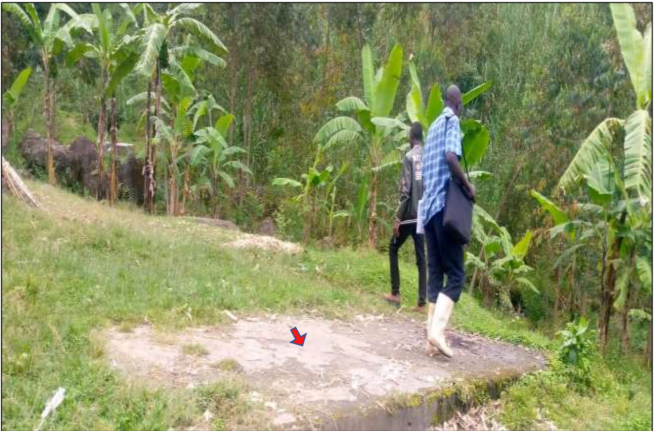
Figure 2: Representative images of the remains of Nametsi Health Center II (Red Arrow), that was sunk by landslides in Bududa District, Eastern Uganda

1 = Strongly Disagree (SD), 2 = Disagree (D), 3 = Not Sure (NS), 4 = Agree (A), 5 = Strongly Agree. The bolded values show the minimal level of agreement on the fact that landslides culminated in livelihood improvement.