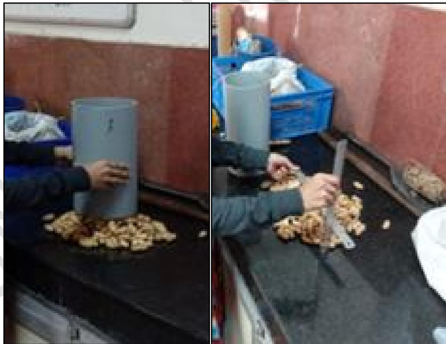
Fig.4: Determination of angle of repose of groundnut pods

where \Theta_f , H and D are angle of repose (degrees), height of heap (mm) and diameter of heap (mm) respectively.