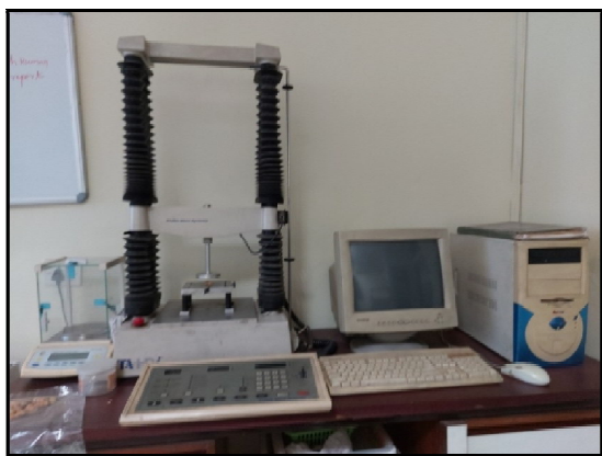
Fig.5: Determination of rupture force of groundnut pod on Texture analyzer

displayed on a computer attached with a Texture Analyzer automatically. This experiment was conducted at the Division of Post Harvest Technology of the Institute.