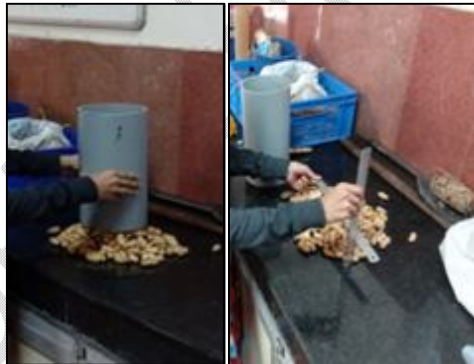
Fig.4: Determination of angle of repose of groundnut pods