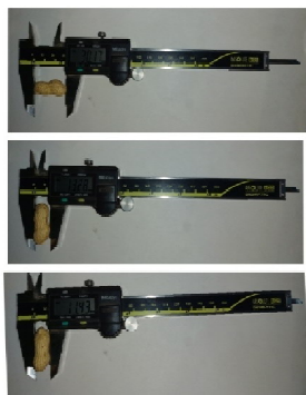
Fig.1: Measurement of size of groundnut pods

kernel with the help of vernier caliper (Fig.1 and Fig.2). The size measurement of groundnut pods and kernels were replicated three times and the observed values were recorded in datasheet (Appendix A.1 and A.2).