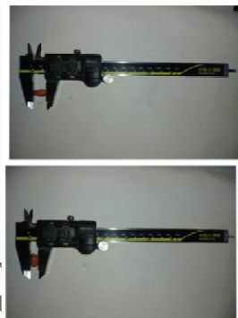
Fig.2: Measurement of size of groundnut kernels