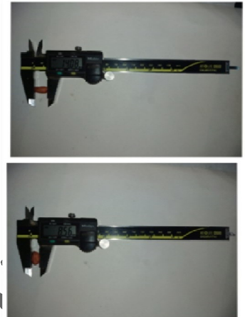
Fig.2: Measurement of size of groundnut