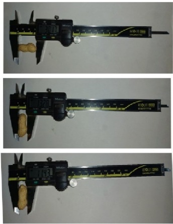
Fig.1: Measurement of size of groundnut

kernel with the help of vernier caliper (Fig.1 and Fig.2). The size measurement of groundnut pods and kernels were replicated three times and the observed values were recorded in datasheet (Appendix A.1 and A.2).