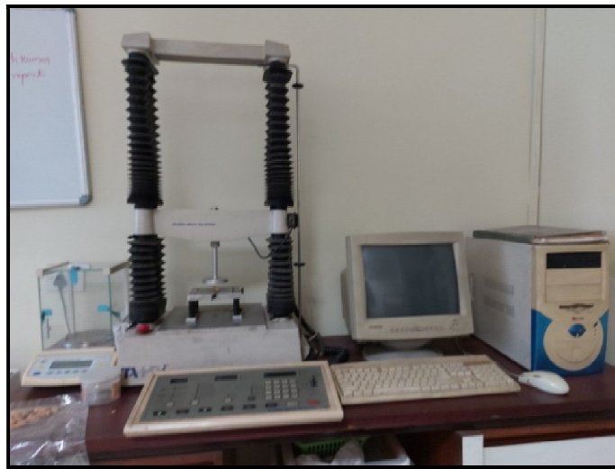
Fig.5: Determination of rupture force of groundnut pod on Texture analyzer

computer attached with a Texture Analyzer automatically. This experiment was conducted at the Division of Post Harvest Technology of the Institute.