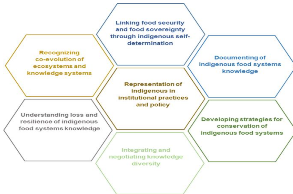
Fig 3: Policy recommendations for indigenous technological systems (Vijayan et al., 2022)