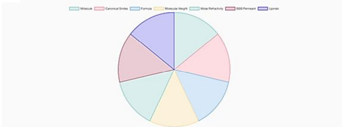
Figure 2: Tabular and graphical visualization of data on the database website