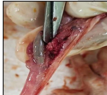
Fig 7: Cecal tonsil haemorrhage