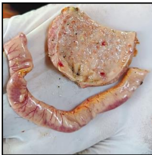
Fig 6: Intestinal and proventricular papillae hemorrhage