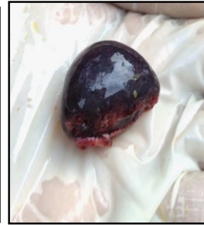
Fig 5: Haemorrhagic spleen