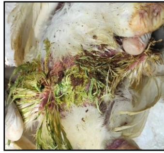
Fig 4: Greenish diarrhea and pasty vent