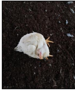
Fig 3: torticollis