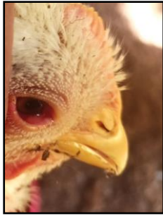
Fig 2: Conjunctivitis