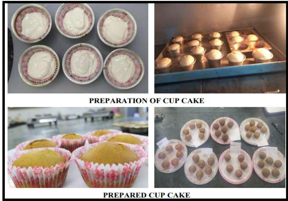
Fig 2: Preparation of Fortified Cupcake