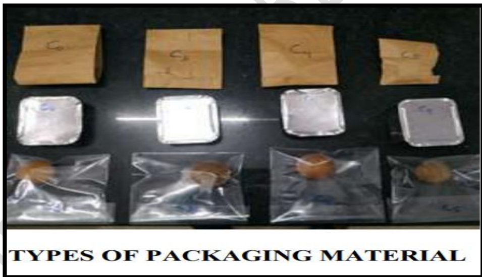
Fig 3: Types of Packaging Material