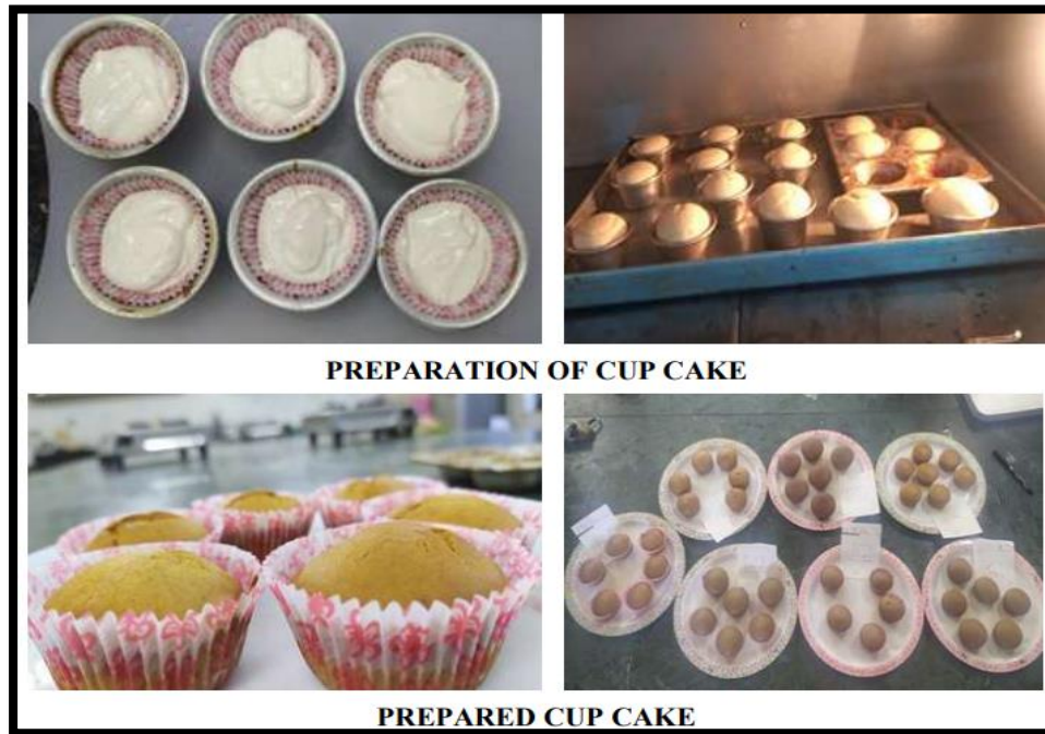
Fig 2: Preparation of Fortified Cupcake

were sealed, and samples of the various packaging materials were collected for analysis at intervals of two days up to eight days.