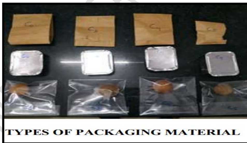
Fig 3: Types of Packaging Material