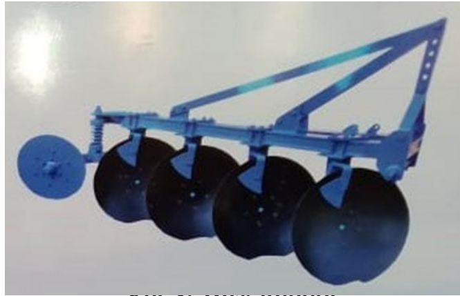
Fig 3: Disc plough