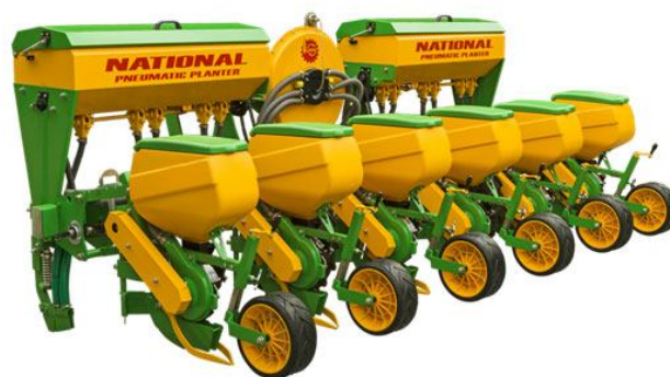
Fig 10: Pneumatic planter