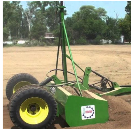
Fig 6: Laser land leveler