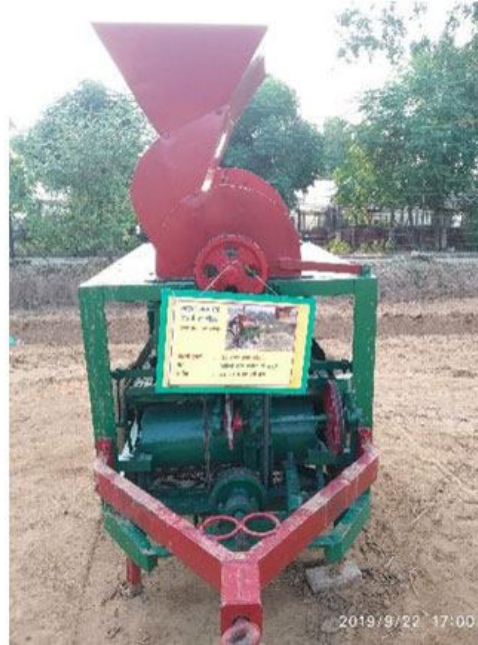
Fig 18: Maize dehusker and sheller