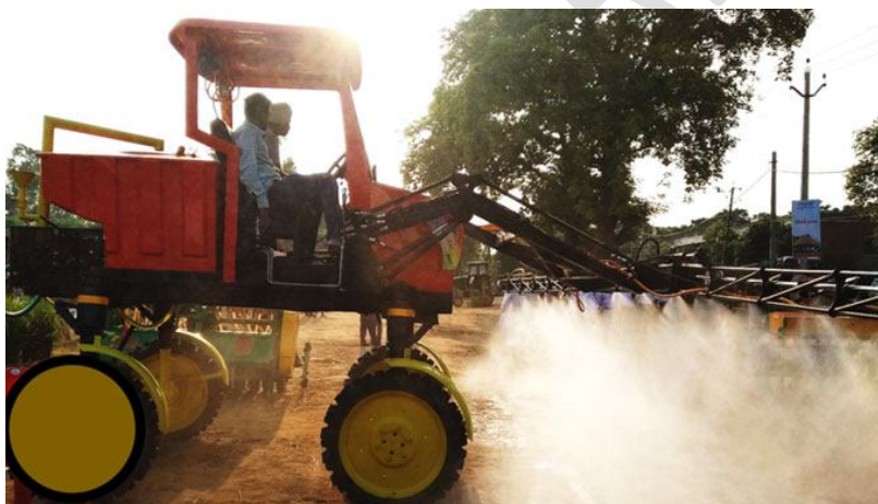
Fig 16: Self-Propelled high clearance sprayer