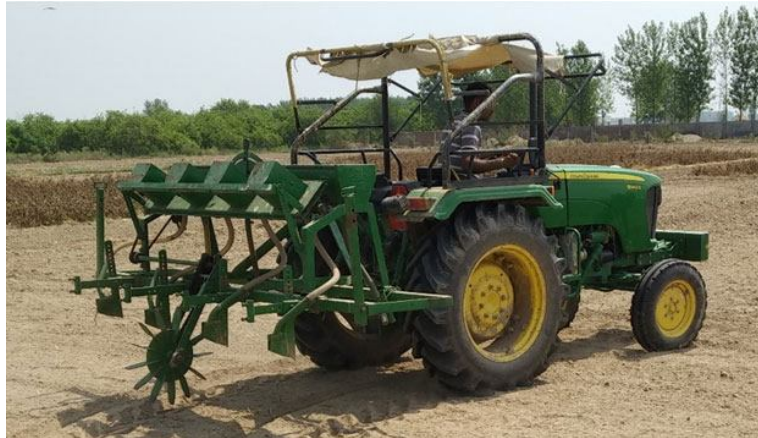
Fig 9: Zero till planter