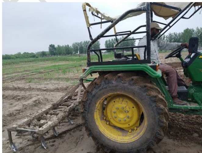
Fig 4: Tyne type cultivator