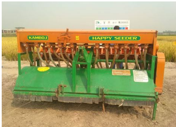
Fig 11: Happy seeder