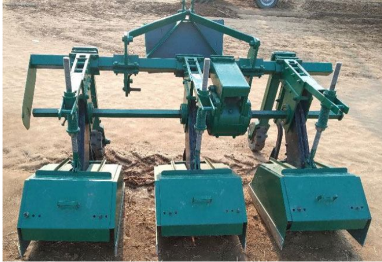
Fig 14: Rotary weeder