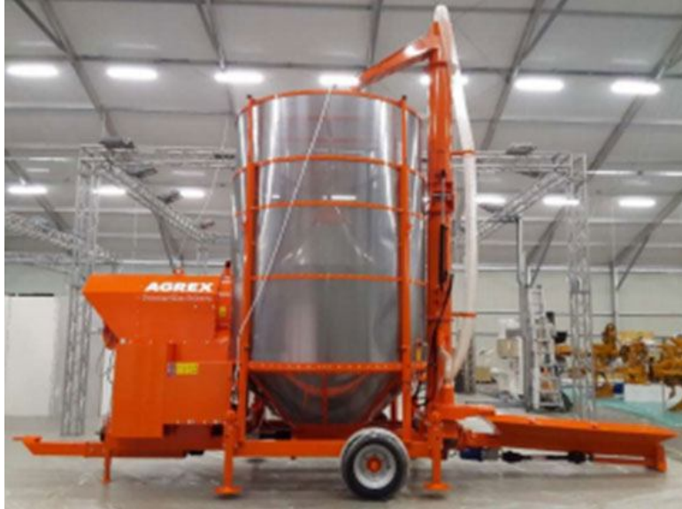
Fig 19: GRAIN DRYING