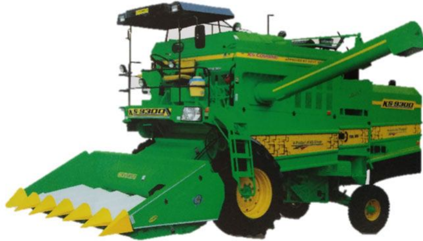
Fig 17: Combine harvester