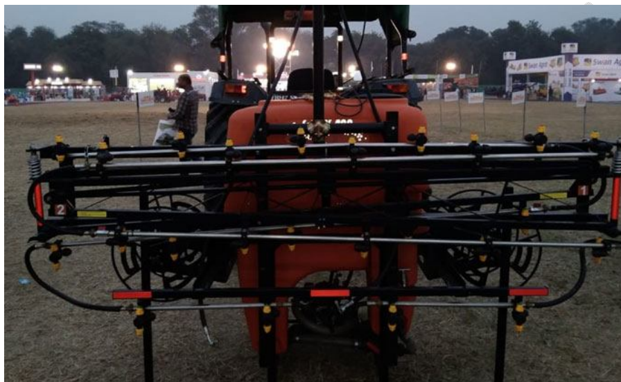
Fig 15: Boom sprayer