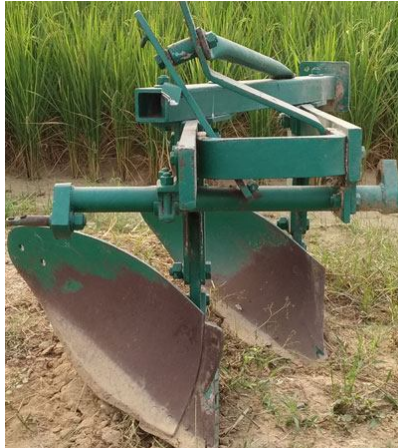
Fig 2: MB plough