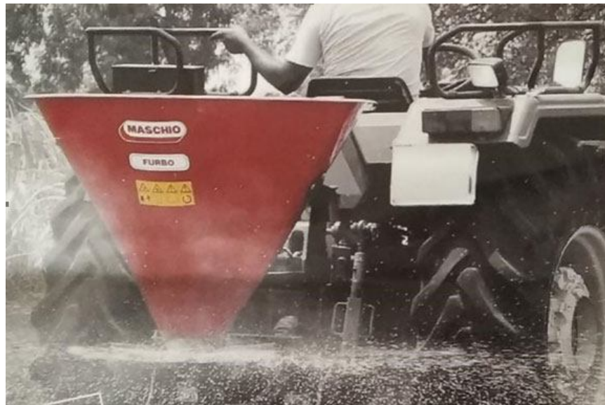
Fig 13: Fertilizer broadcaster

The tractor-driven three-row fertilizer band placement cum earthing-up machine performs three essential tasks in a single operation: