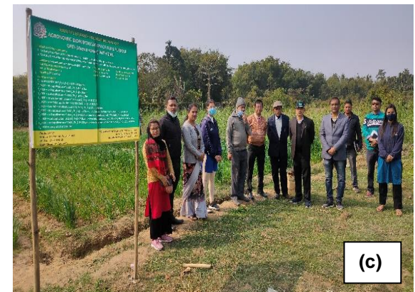
Fig 2. (a) Data Collection, (b) Foliar application treatment of zinc sulphate and (c) Field visit by the faculty of Department of Agronomy, Assam Agricultural University, Jorhat, Assam.