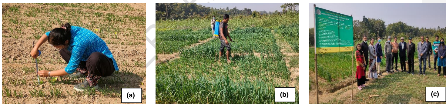
Fig 2. (a) Data Collection, (b) Foliar application treatment of zinc sulphate and (c) Field visit by the faculty of Department of Agronomy, Assam Agricultural University, Jorhat, Assam.