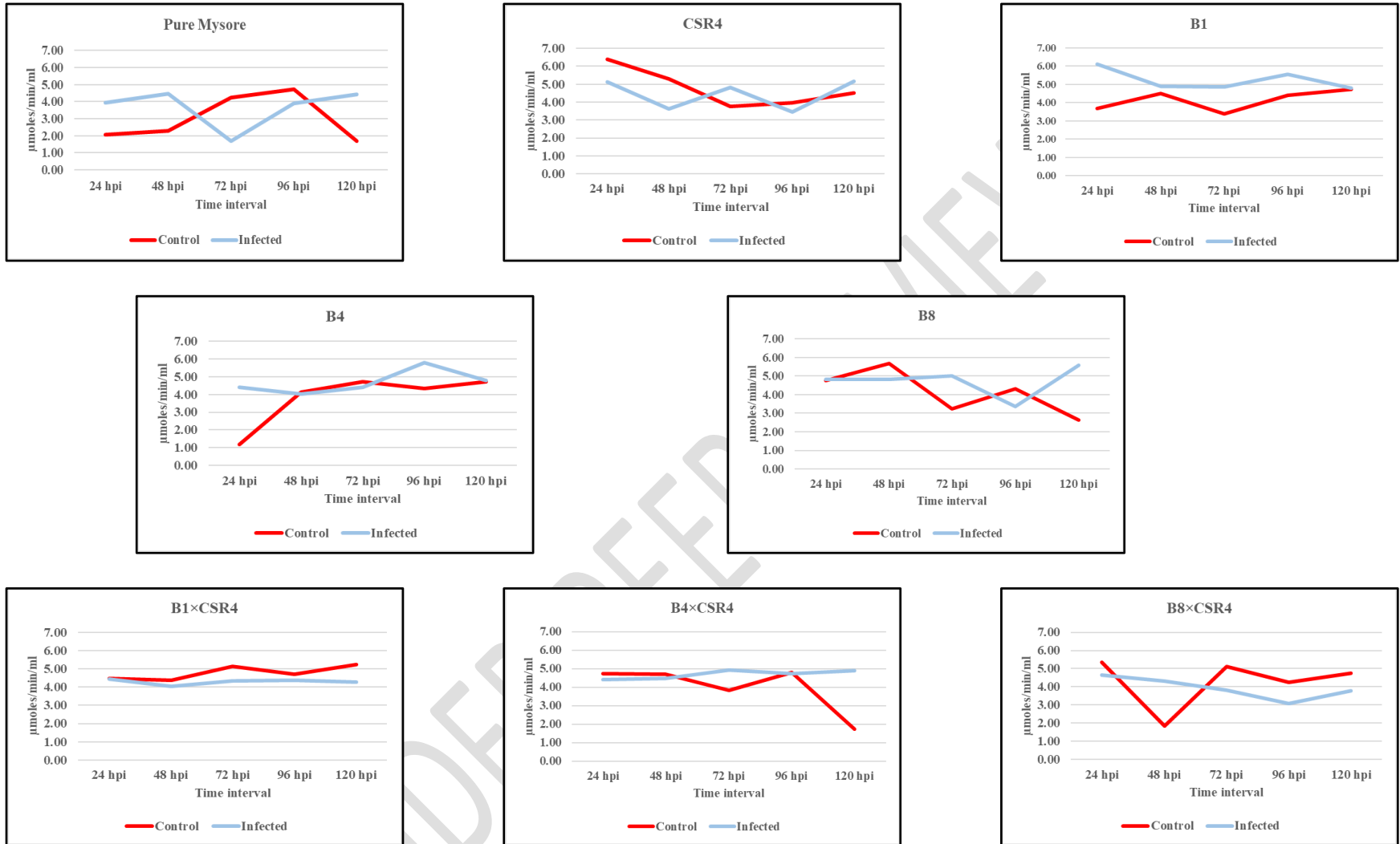
Fig 2. Catalase enzyme activity in thermotolerant bivoltine silk worm breeds and hybrids under control and muscardine inoculation at different time interval