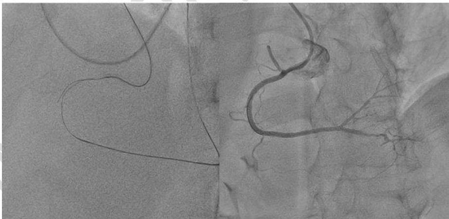
Fig1: Coronary angiography showing occlusion of the right coronary revascularized by an active stent