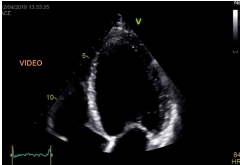
Fig2: Echocardiographic image showing ischemic heart disease in the dilated stage with severe LV dysfunction (EF 35%) during his hospitalization.