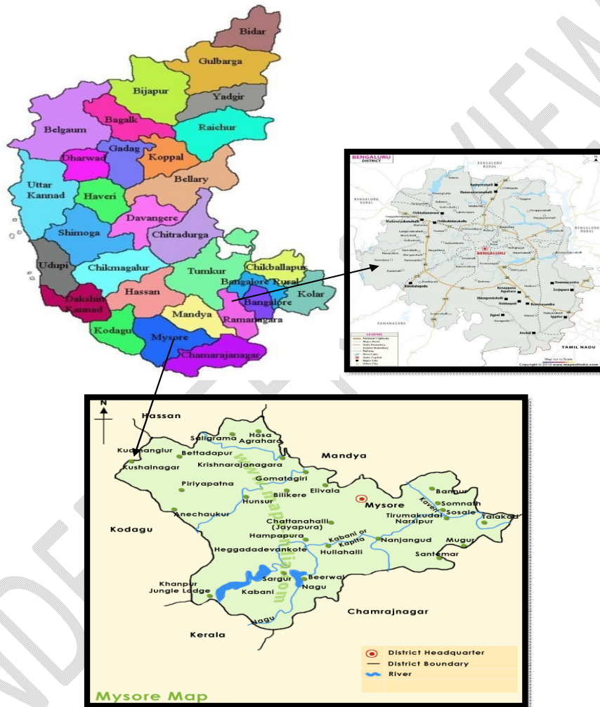
Fig.1:Map showing Bengaluru and Mysuru districts of Karnataka

Daily rainfall data for two meteorological stations, GKVK in Bengaluru district and Naganahalli in Mysuru district, Karnataka, were collected for the period 1983 to 2018 (36 years) from the AICRP on Agro-Meteorology, GKVK, UAS, Bengaluru. The data were recorded using a standard rain gauge and measured in millimeters, providing a reliable basis for the analysis.