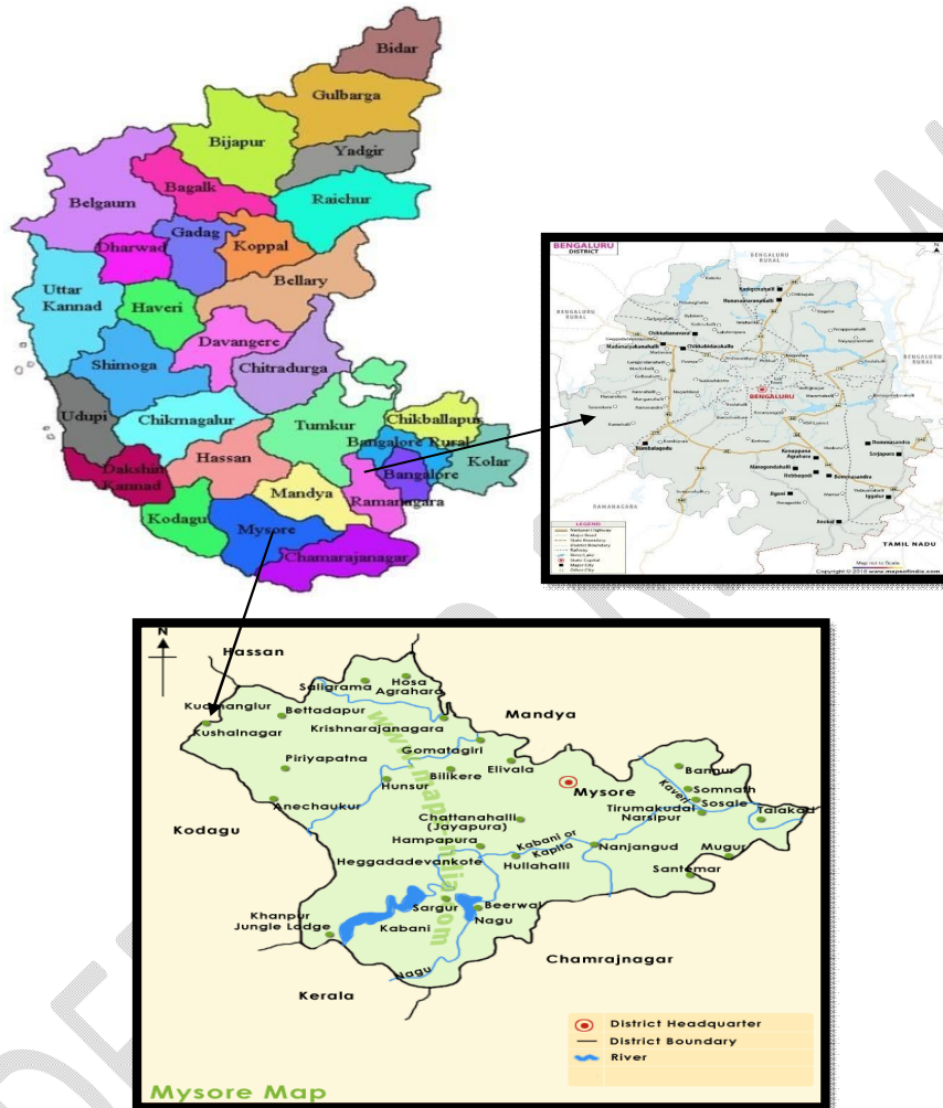
Fig.1:Map showing Bengaluru and Mysuru districts of Karnataka

Daily rainfall data for two meteorological stations, GKVK in Bengaluru district and Naganahalli in Mysuru district, Karnataka, were collected for the period 1983 to 2018 (36 years) from the AICRP on Agro-Meteorology, GKVK, UAS, Bengaluru. The data were recorded using a standard rain gauge and measured in millimeters, providing a reliable basis for the analysis.