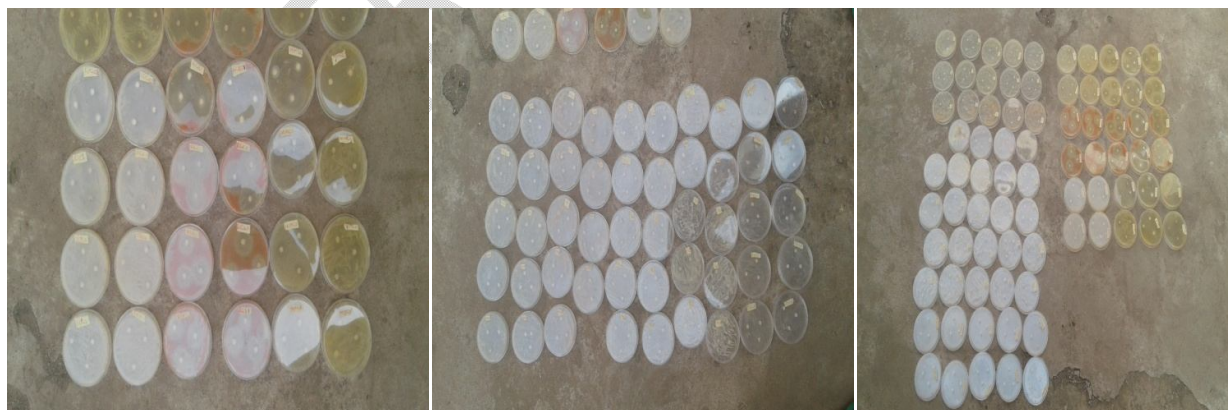
Figure 4: Antimicrobial sensitivity test plates

Key: a = 100 % inhibition (highly effective); b = 50 – 99 % inhibition (effective); c = 20 – 49 % inhibition (moderately effective); d = 0 -19 % inhibition (slightly effective); e = ≤ 0 % inhibition (not effective) [65].