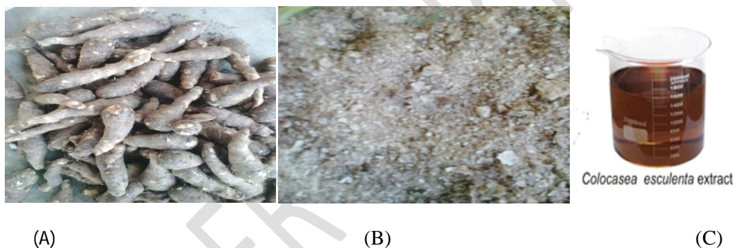
Figure 1: Colocasia esculenta (A)tuber (B) tuber peels(powder), and (C) methanolic tuber peel extract

The extract was kept in the refrigerator for further analysis.