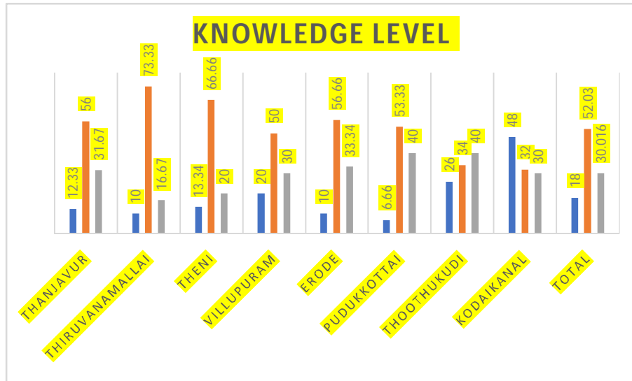
Figure 2: Farmers knowledge

Misinformation and preconceptions: In certain circumstances, farmers are misinformed or have preconceptions regarding bio-inputs, which leads to hesitation and a lack of expertise. Negative prior experiences or anecdotal evidence against bio-inputs may also contribute to this. (Figure 2)