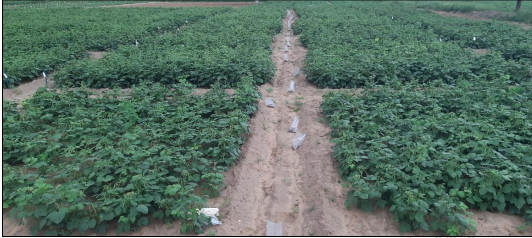
Fig .1 The general view of the experimental site of the Mungbean (Var. GM-4) crop .