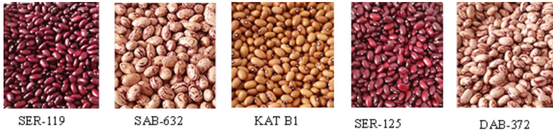
Picture 1. Demonstrated and evaluated varieties