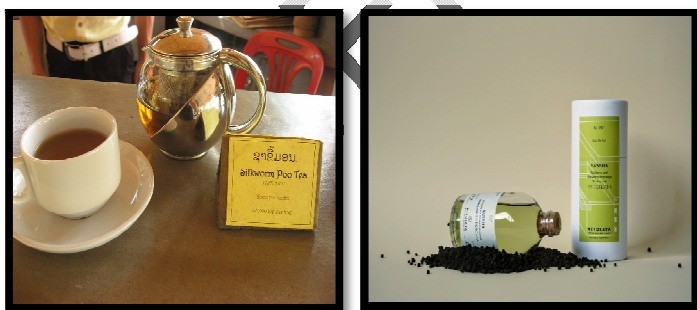
Fig7. Beverages from silkworm excreta