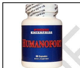
Fig 3. Humanofort-B

Chitin is one of the most widely used polymers next only to cellulose. Rather than chitin, its deacetylated form chitosan is more widely used for commercial applications. Silkworm egg shell chitosan has antibacterial and anti-fungal activity similar or better than commercially available chitosan. With large availability and limited applications, egg shells can be used as renewable and sustainable sources for chitosan [2]. The protein extract of egg shell is sold as the Humanofort B product in Romania (fig.3). Albumin, lipids, carbohydrates, glycoproteins, vitamins B1 and B2, and other substances are present in the eggs. The eggs are turned into a protein extract, which is then utilised in the food and pharmaceutical industries to make medications with hepatoprotein-stimulating, hypolipidic, and hypoglycemic effects as well as for male sexual stimulation [7]. There is a belief in Bulgaria that if silkworm eggs eaten by alcohol drinkers, give up drinking completely because, they start feeling disgust. But the fact has not been proved scientifically.