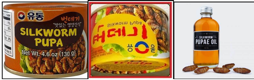
Fig 5. Some pupal processed health benefit products