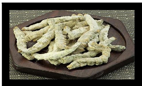
Fig 4. Dried silkworm larvae

compounds, including DNJ (1-deoxynojirimycin), were found to be ineffective in decreasing blood glucose levels. The silkworm has the highest concentration of DNJ per gram compared to mulberry leaves, mulberry fruit, and syncarp. This suggests that DNJ is deposited in the silkworm body. Additionally, fatty liver disease is treated with silkworm powder. An increase in liver serum triglycerides is what causes fatty liver disease. The mature silkworm powder greatly reduced the hepatic buildup of triglycerides caused by ethanol treatment [5]. Traditional Chinese medicine in China employs dried silkworm larvae infected with muscardine to treat a range of underlying conditions, including spasms and flatulence (Fig.4). Silkworm larvae that are sick are frequently tossed in India. Beauveria bassiana infection causes white spores to appear in the body of the silkworm, which are then dried and utilized as treatments. The intestine of silkworm larvae is used to produce a unique kind of thread that is utilized in surgery. The intestine of silkworms and their glands are used to prepare the surgical gut. The braided scaffolds revealed higher tensile strength and strain at break values in the case of Samia cynthia ricini and Bombyx mori materials with a potential application in tissue engineering [6].