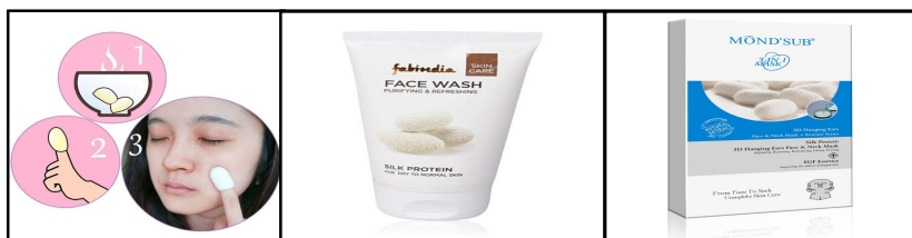
Fig6. Cocoon as cosmetics