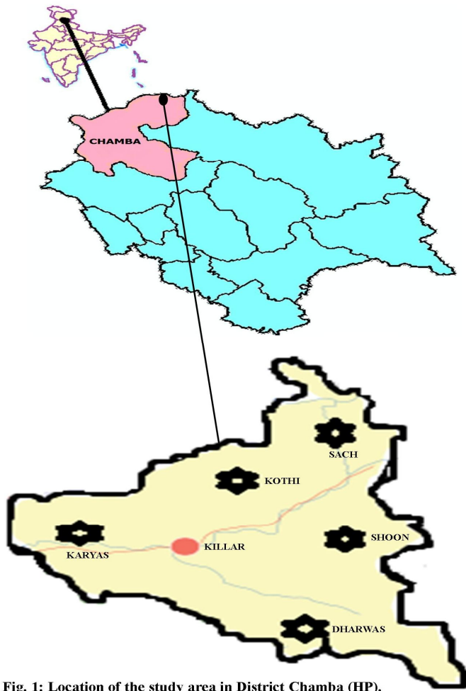
Fig. 1: Location of the study area in District Chamba (HP).