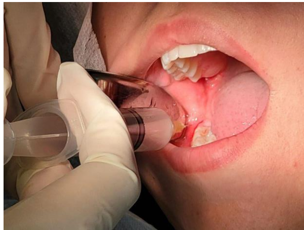
Figure 5 - Ozonized sunflower oil - Topical application on the suture.