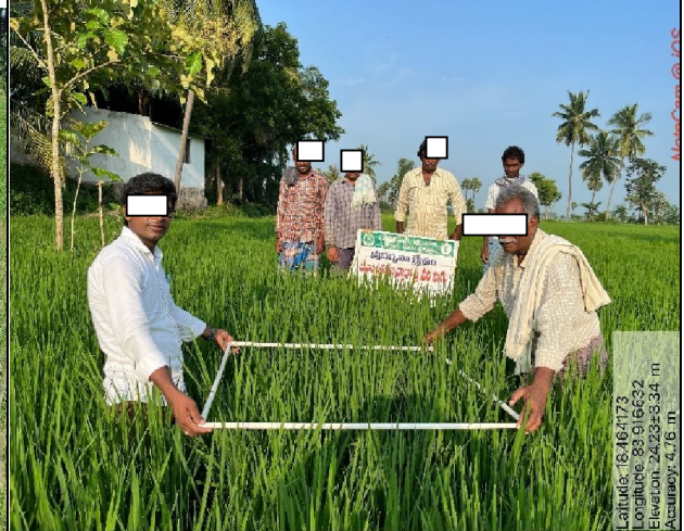
Fig 4 : Taking of Biometric Observations