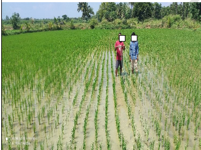
Fig 3 : After planting with MSRI planter