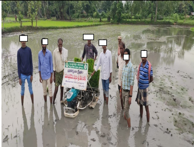
fig 2 : Planting of the paddy with MSRI Planter