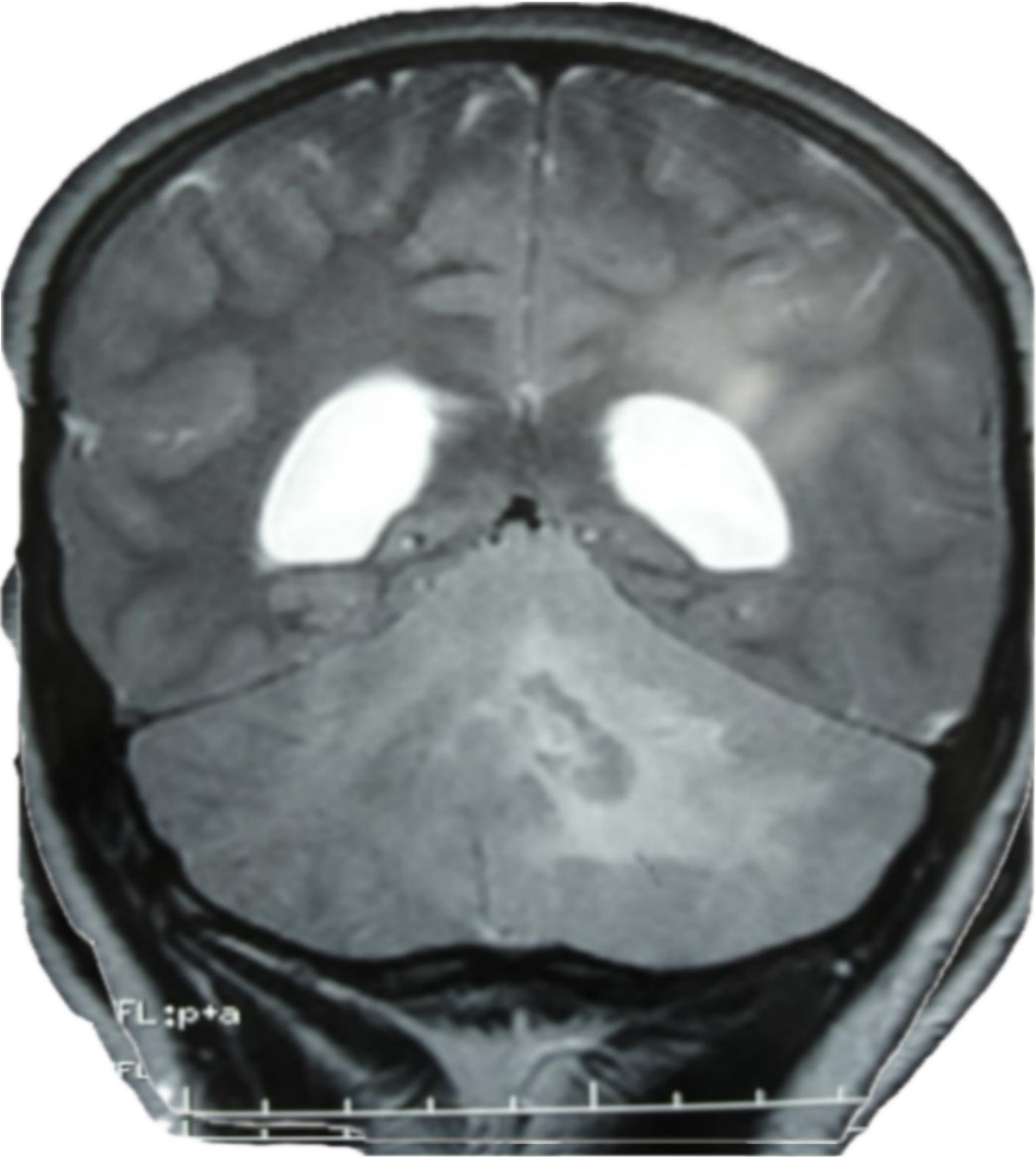
Fig 2. Scan report