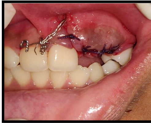
Figure 4. Closure done with 3-0 vicryl sutures after extraction of 62 and 63

Orthodontic management was done after surgical removal of lesion.[Figure 5 and 6]