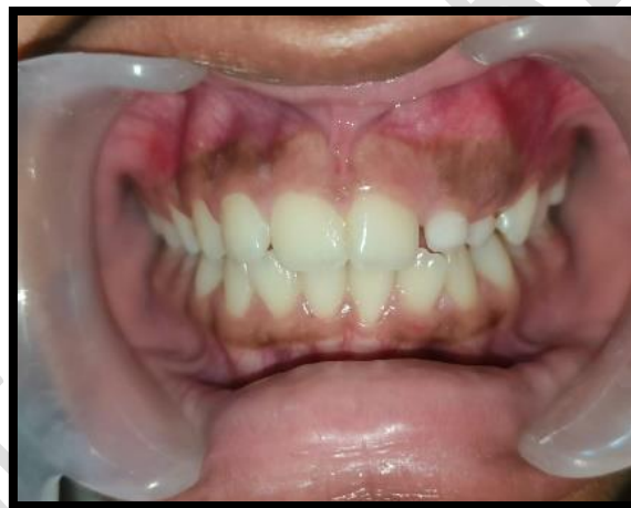
Figure 1. Over Retained left maxillary lateral incisor and canine with solitary bulge seen on attached gingiva w.r.t. 62 and 63

Intraoral examination revealed total 28 teeth, with over retained 62,63. On Inspection a solitary dome shaped intraoral bulge felt on left maxillary arch involving attached gingiva and alveolar mucosa extending mediolaterally from mesial aspect of 62 to distal aspect of 24 and superoinferiorly from alveolar mucosa to attached gingiva of approximately 1.5 x 2cm in size with a color like rest of gingiva. On palpation It was non tender, firm in consistency, with smooth surface, non-compressible, non-fluctuant, non-reducible, non-pulsatile [Figure 1].