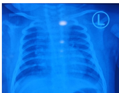
Figure 1. Chest Xray showed hyper- inflated lungs.

Bronchogenic cyst can also be associated with tracheobronchomalacia in which the affected bronchus lacking rigidity because of insufficient cartilages or extrinsic compression, which had happened in our patient. There is a reported case of bronchogenic cyst in neonate which experienced a complete resolution of tracheobronchomalacia after surgical excision. (6) There were also cases with residual tracheobronchomalacia present after surgery. Although this patient is showing improvement in recovery, we will continue to follow up her for a longer period of time to review her general condition.