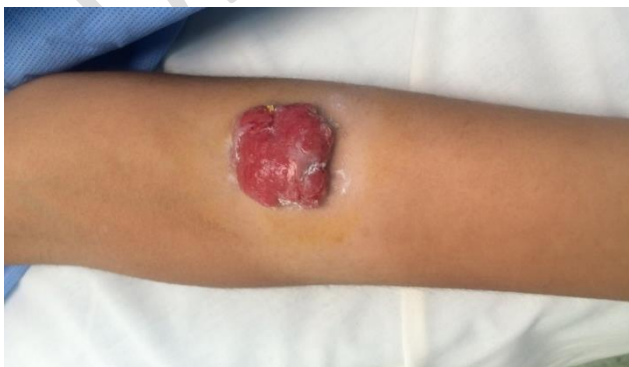
Figure 1: clinical appearance of the tumor

Hidradenoma is an uncommon adnexal tumor, without being extremely frequent. Immunohistochemistry remains the only examination that can differentiate benign from malignant forms due to the clinical and pathological difficulties. Surgical resection is the rule because of the risk of malignant transformation.