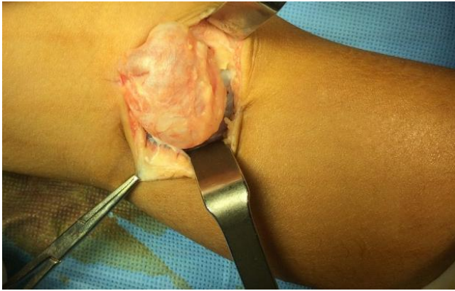
Figure 2: intraoperative appearance