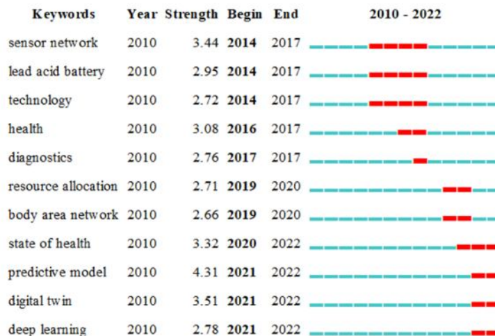
Figure 1 The evolution of key terms cited in this field is most strongly manifested in the emergence of specific themes.

The clustering analysis of the dataset reveals corresponding research themes. From the graph, it is evident that there is a close relationship among various research themes. However, the original clustering intertwines methods and objects. To delve further into the commonly used methods in the health maintenance of complex equipment, refinement of the clustering results is necessary. As shown in Figure 2, the clustered research primarily focuses on methods such as deep learning, risk and management, data modeling, fog computing, the Internet of Things, and deep reinforcement learning [14] .