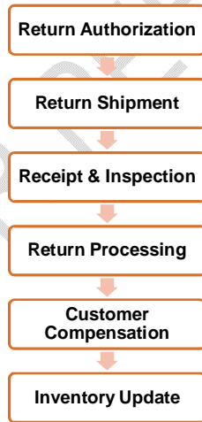
Fig. 1. Process of returns management

The analysis revealed that a well-structured returns management system, consisting of several key stages, plays a crucial role in handling returned seeds effectively. The flow of the returns management process was systematically organized, beginning with return authorization and progressing through return shipment, inspection, classification, processing, inventory updates and communication with distribution partners.