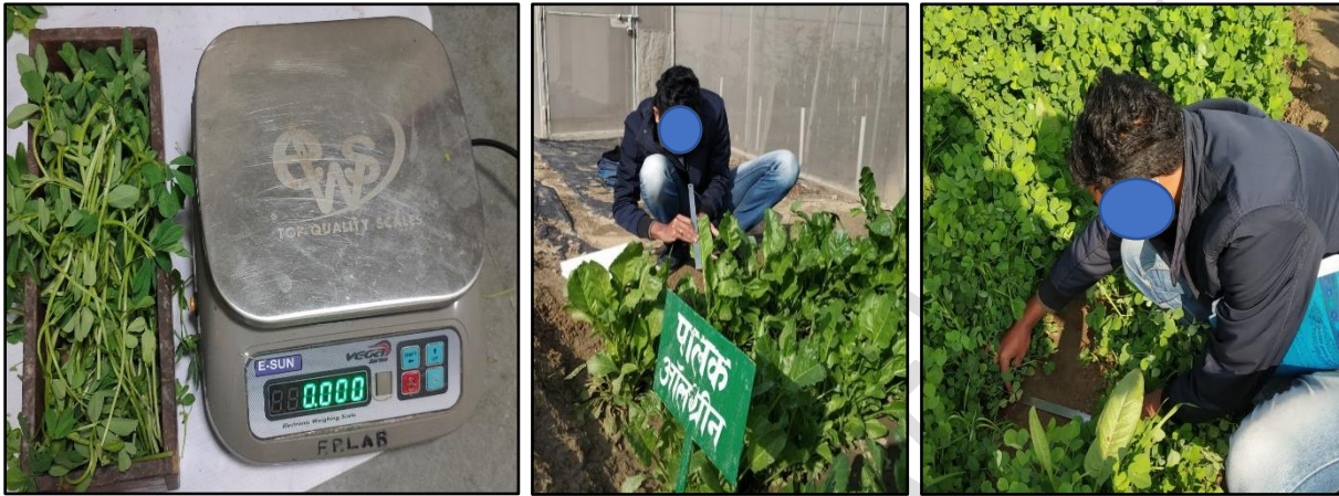
Plate 1. Study of Physical properties and crop geometry

The height of the leaves from the ground surface was measured using a ruler. The ruler was placed vertically from a point on the ground up to the base of the leaf. The measurement device was kept parallel to the plant's stem or main axis when observations were taken.